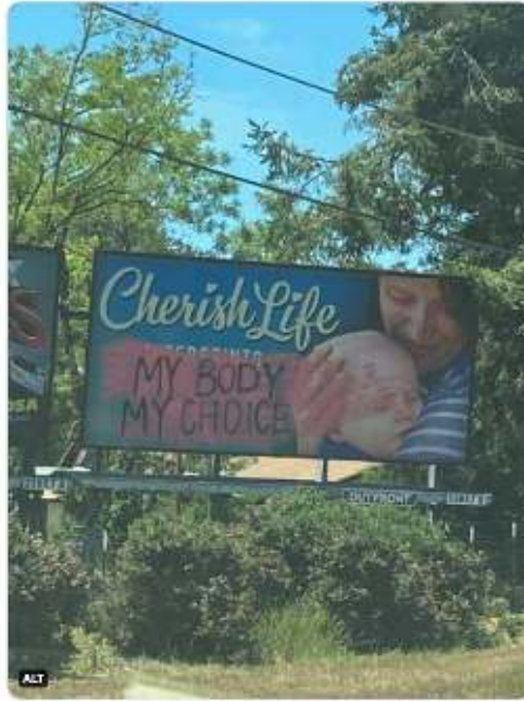
5:40 PM · May 24, 2022 · Twitter for Android

"My Body, My Choice" Painted on an anti-abortion billboard in Sebastopol, California